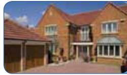
Private Dwelling House, Lowdham, Notts – Hardwicke Oakham blend